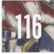
116 FERNAND LÉGER: METALLIC SENSATIONS MATTHEW AFFRON