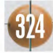
324 EARLY ABSTRACTION IN POLAND JAROSLAW SUCHAN