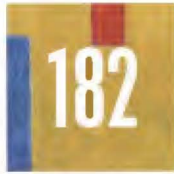
182 DECORATION AND ABSTRACTION IN BLOOMSBURY MATTHEW AFFRON