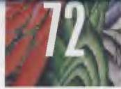
72 ON THE MOVE HUBERT DAMISCH