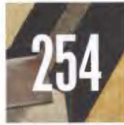
254 THE SPATIAL OBJECT MARIA GOUGH