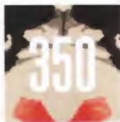
350 CONCRETE ABSTRACTION PETER GALISON