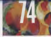
74 ABSTRACTION CHEZ DELAUNAY GORDON HUGHES