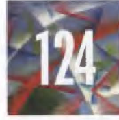
124 GIACOMO BALLA: THE MOST LUMINOUS ABSTRACTION ESTER COEN