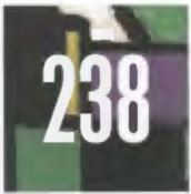
238 3 DE STIJL MODELS YVE-ALAIN BOIS